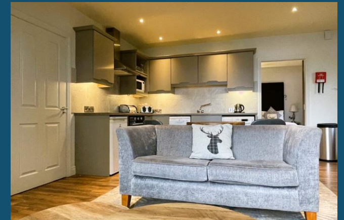
Lusty Beg, Kesh

4% of the available hotel rooms in NI are in Fermanagh & Omagh LGD.