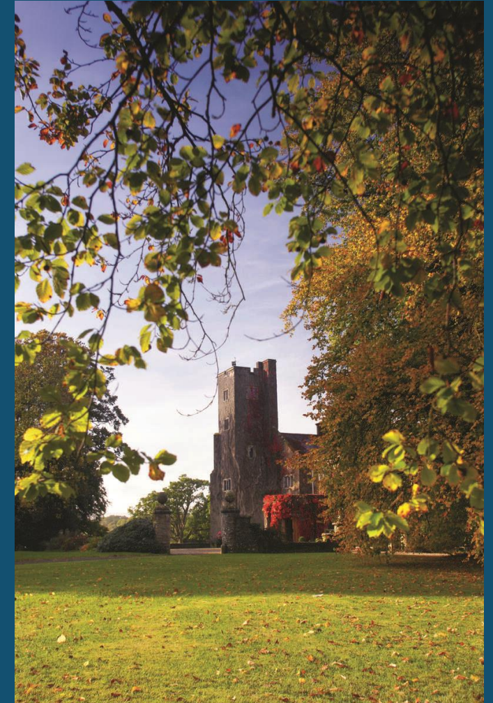
Belle Isle Estate, Lisbellaw

Figures exclude school, university and college stock which offer accommodation, totalling 9 premises with 3,580 rooms and 3,984 bed-spaces