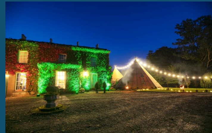
Crannagael House, Portadown