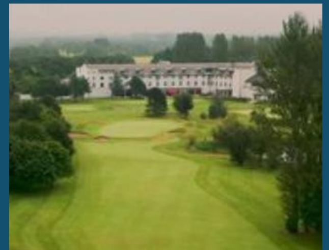
Kingfisher Country Estate, Templepatrick