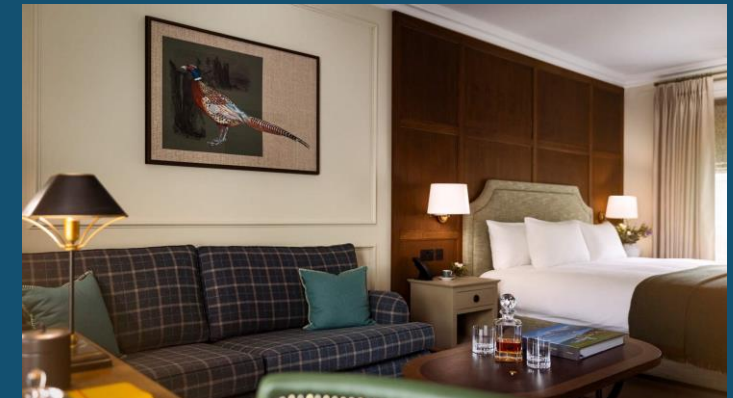
Dunluce Lodge, Portrush