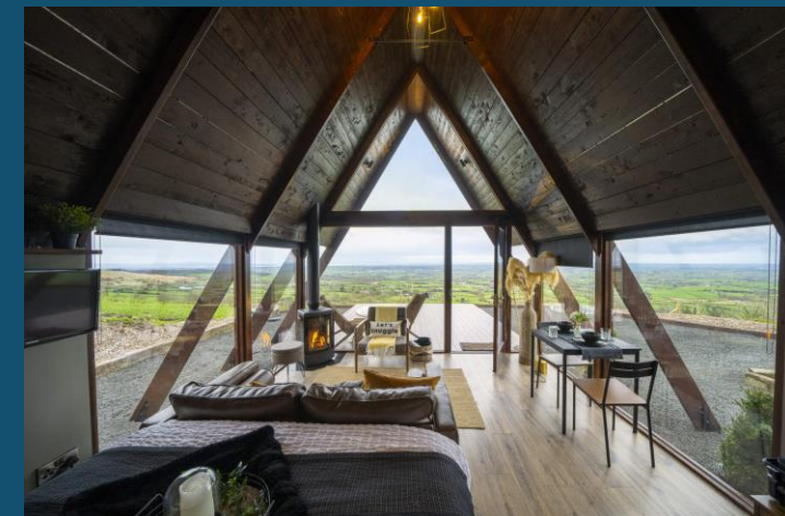
Letteran Lodges, Magherafelt