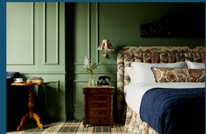
Slieve Donard Hotel, Newcastle

This LGD has 6% of the available hotel rooms in NI.