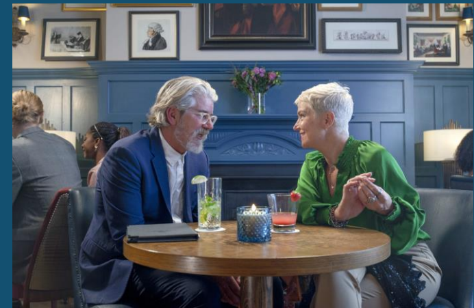
Bishop's Gate Hotel, Derry-Londonderry