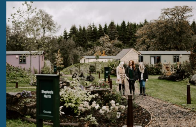
Galgorm Resort, Galgorm

Mid & East Antrim has 7% of the available GH/GA/B&B rooms in NI and 5% of the available self-catering rooms.