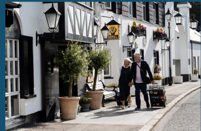
The Old Inn, Crawfordsburn