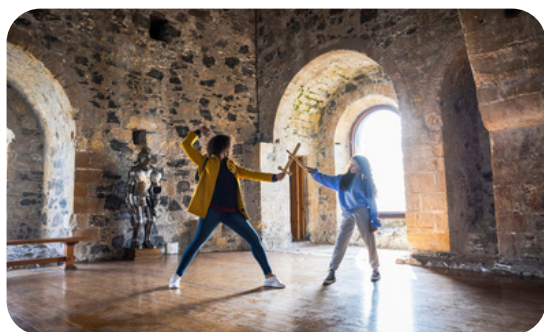
Causeway Coastal Route - w/c 11th August