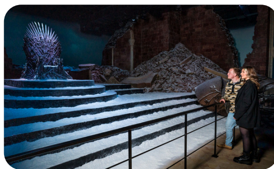
Armagh & Down - w/c 4 th August