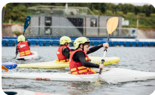
Belfast - w/c 28th July